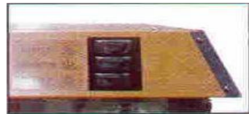
3 Individual Control Switch for different function